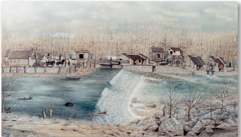
Lower DuPont powder yards, crayon sketch by Pierre Gentieu; March, 1878, Hagley Museum Collection - #55G4/P23-7

On your walk to Workers' Hill, try to imagine what it might have been like back then. Have a great time on your trip back to the nineteenth century!