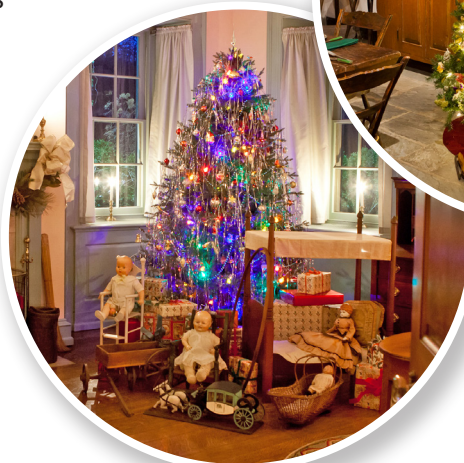
CHRISTMAS TREES IN THE ELEUTHERIAN MILLS PARLOR, TERRACE ROOM, AND LIBRARY