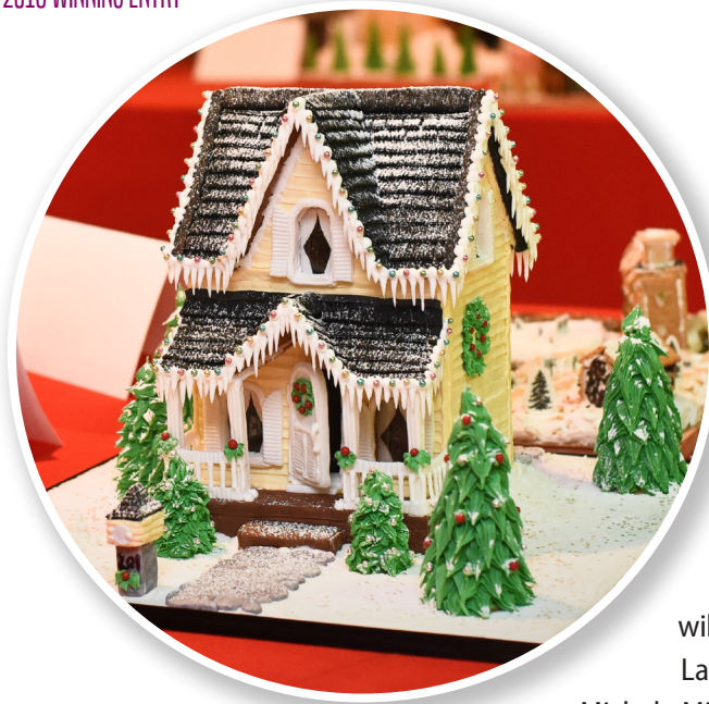
MICHELE MITCHELL'S 2018 WINNING ENTRY