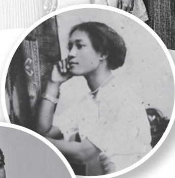
HOWARD HIGH SCHOOL, 1929

Of course, reflecting more diverse experiences with American business and innovation can also be accomplished through targeted collecting. For more than two decades, Hagley's collections development policy has included goals toward this end, and it has borne results by attracting scholars engaged in the important work of remedying gaps in the historical record. More can and will be done, including reaching out to African American businesses, trade associations, and individuals who can share their stories.