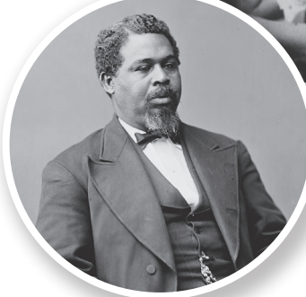
ROBERT SMALLS, FORMER SLAVE AND CIVIL WAR HERO