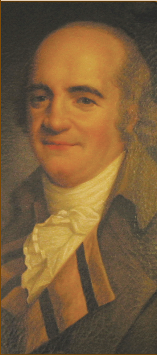
Pierre Samuel du Pont de Nemours (1739-1817), pastel drawing by Joseph Ducreaux; Paris, France; ca. 1795, Hagley Museum Collection - #77.22

It turned out that DuPont gunpowder really was better than other powder available in the United States, and it cost less to make. Black powder, as gunpowder was called then, was used for much more than just hunting. Mining and railroad companies used it for blasting away rock, and farmers used it to clear land. The company made its first government sale in 1804, when the U.S. Marines attacked the Barbary pirates to rescue American hostages. When the War of 1812 began, the military demand for powder was so great that E. I. had to expand his company. He bought a piece of land next to his original powder mills named Hagley and opened a second powder yard. In 1829, he added a third powder yard. Yet even though the company was selling a lot of powder and continuing to expand, E. I. was constantly in debt and unsure about the company's future. The day he died in 1834, he had just finished a meeting with some businessmen to whom he owed money. It was not until after the Civil War (1861-1865) that the company became financially successful. By the 1890s, the DuPont Company was able to buy out its competitors' powder yards in eight other states.