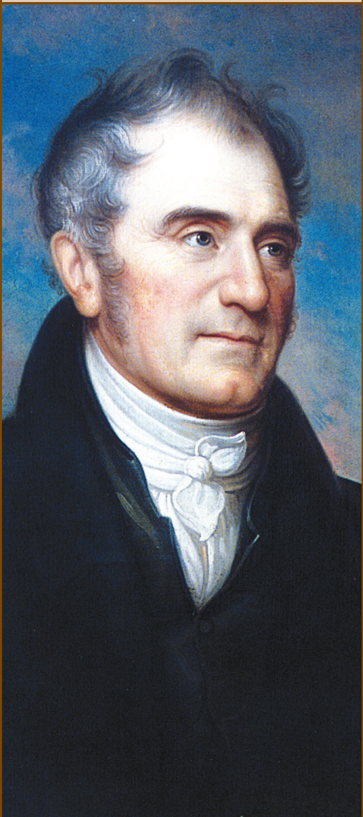
Eleuthère Irénée du Pont (1771-1834)

oil portrait by Rembrandt Peale, Philadelphia, PA; 1831, Private collection