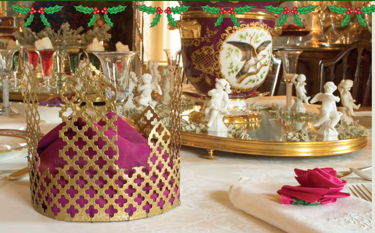
Twelfth Night decorations in the Eleutherian Mills dining room.